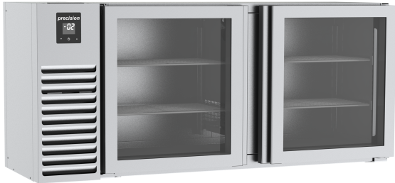
HWU211 (Glass Doors)

Precision's durable all stainless steel GN1/1 wall cabinets have been designed to provide commercial caterers with reliable, energy and cost efficient refrigerated storage solutions when space is at a premium.